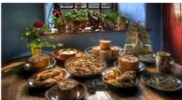
A Celebration of the Table

Locally produced vegetables, regional delicacies and specialities, demonstrations by a star-cook, plus approximately 50 potters that show and sell their handmade salad bowls, cups, plates and ovenshelves, casseroles and jugs, all under the motto: Good food deserves good crockery and tableware.